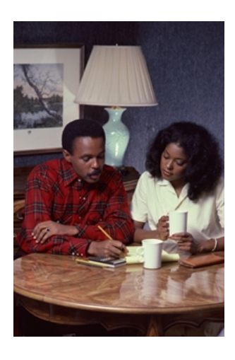
Once you have an idea of your retirement income needs, your next step is to assess how prepared you are to meet those needs. In other words, what sources of retirement income will be available to you?

get by. It's fine to use a percentage of your current income as a benchmark, but it's worth going through all of your current expenses in detail, and really thinking about how those expenses will change over time as you transition into retirement.